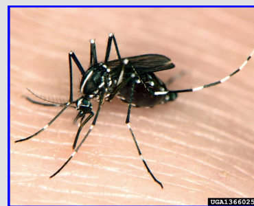
Asian Tiger Mosquito Aedes albopictus